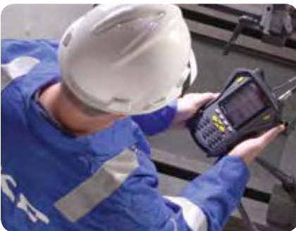
LEFT: The SKF Microlog product line includes portable data collectors/analyzers for use by maintenance and operations.