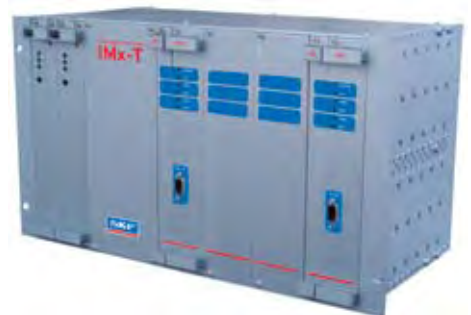
RIGHT: The SKF Multilog product line includes permanently installed sensors for continuous on-line monitoring.