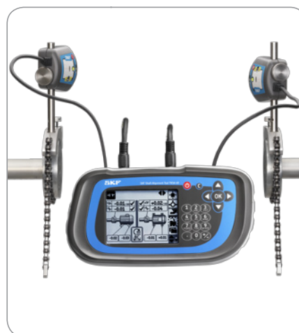
Easy result storage values