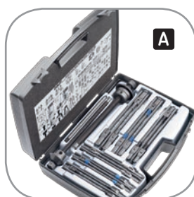
A Bearing selection chart included