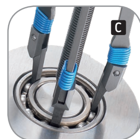
C The springs are colour-coded for easy arm selection and matching